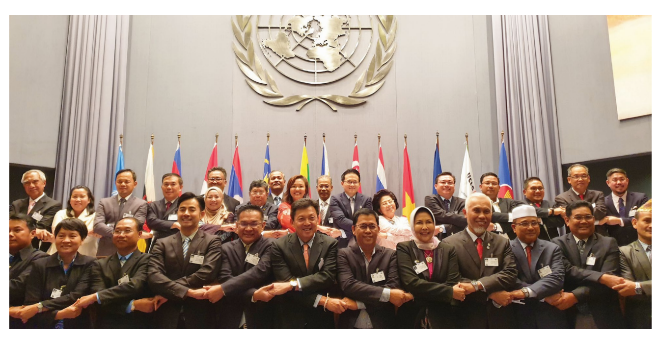
Philippine city mayors join the rest of the ASEAN delegates for a group photo after the reading of the ASEAN Mayors' Declaration on 27 August 2019

In keeping with its commitment to support the urban ASEAN community at large, the League, through its members, attended the fifth ASEAN Mayors Forum (AMF) on 26-28 August 2019 at the United Nations Conference Centre in Bangkok, Thailand.