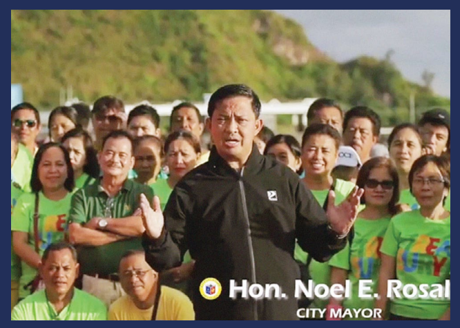
Legazpi City Mayor Noel Rosal organizes a coastal cleanup and mangrove tree planting activity in his challenge video