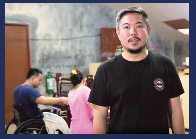
Vigan City Mayor Carlo Medina showcases his local government's efforts to offer livelihood to persons with disabilities working as loom weavers