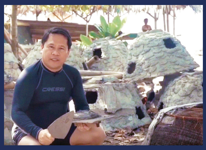
Tagum City Mayor Allan Rellon builds artificial coral reefs to support fish population in his city

Legazpi City Mayor Noel Rosal accepted Gomez's nomination by leading a back-to-back community coastal cleanup and mangrove tree planting activity participated by city government employees and local townsfolk.