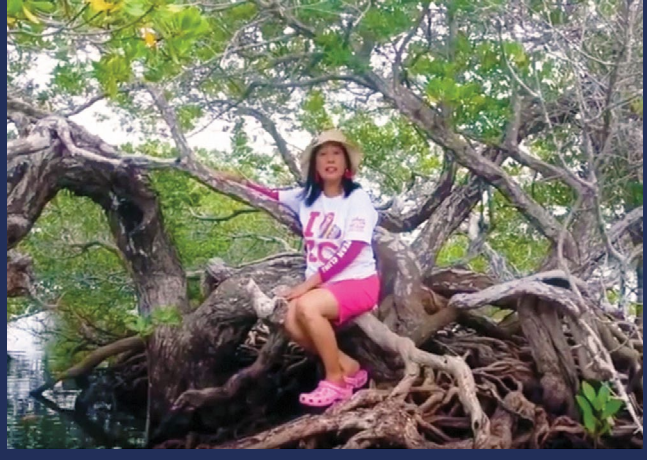
In her challenge video, Zamboanga City Mayor Beng Climaco gives a tour of Santa Cruz Island where protection and conservation efforts are ongoing