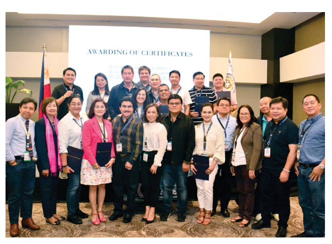
Members of the LCP executive board take a group photo with representatives from the DAP after the awarding of certificates

City mayors adopted the League of Cities of the Philippines Executive Agenda for 2019-2022 during the 69th National Executive Board (NEB) Meeting on 27 September 2019 at the dusitD2 Davao Hotel.