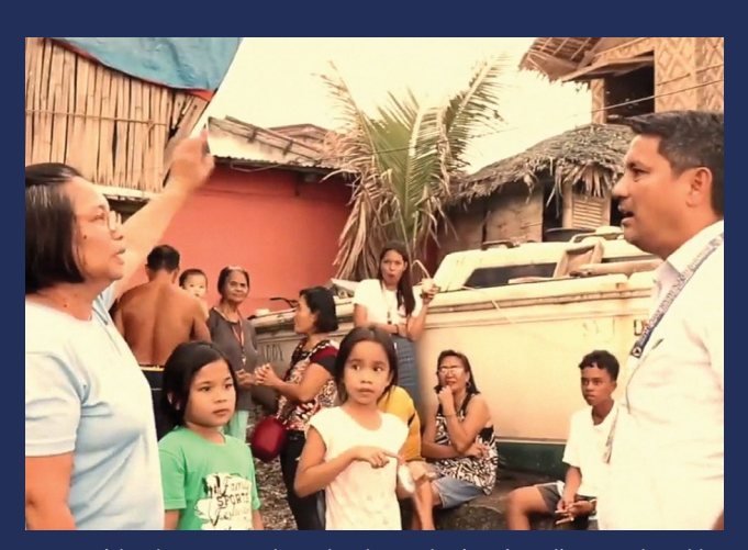
Mayor Richard Gomez conducts local consultations in a climate-vulnerable community in Ormoc City